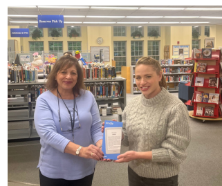
Winner of Kindle from Library Card Sign-Up Month