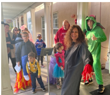
1st Annual Haunted House