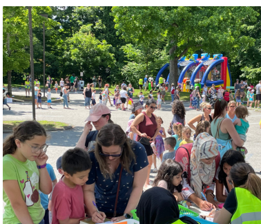
Summer Reading Kickoff