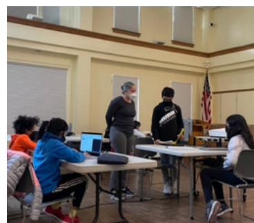
Teen Python Coding Class