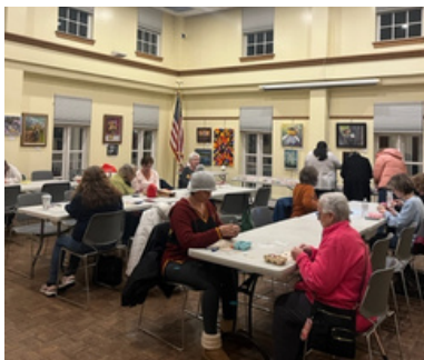
Earring making workshop

Want to stay in the loop? Join our newsletter!