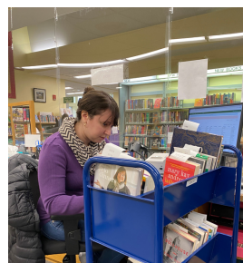
Processing books upon return

219,572 books, movies & audiobooks were borrowed 87,028 e-books, e-magazines & e-audiobooks were downloaded or streamed