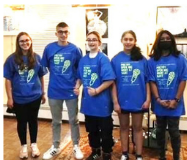
Teen Poetry Night