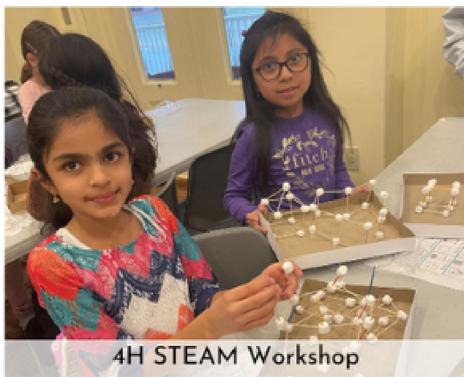
4H STEAM Workshop