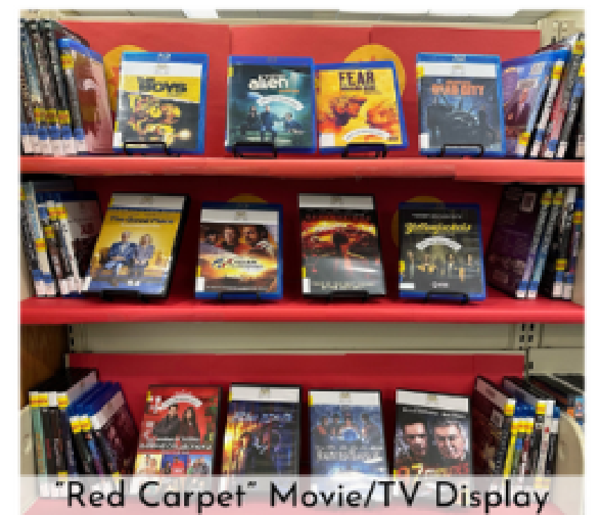
"Red Carpet" Movie/TV Display