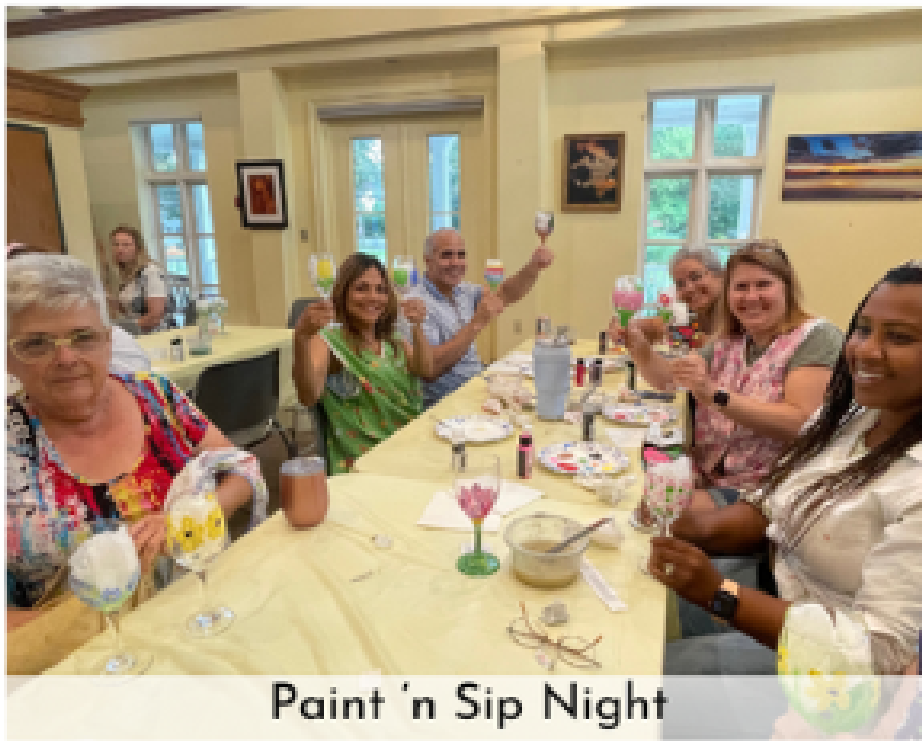
Paint 'n Sip Night