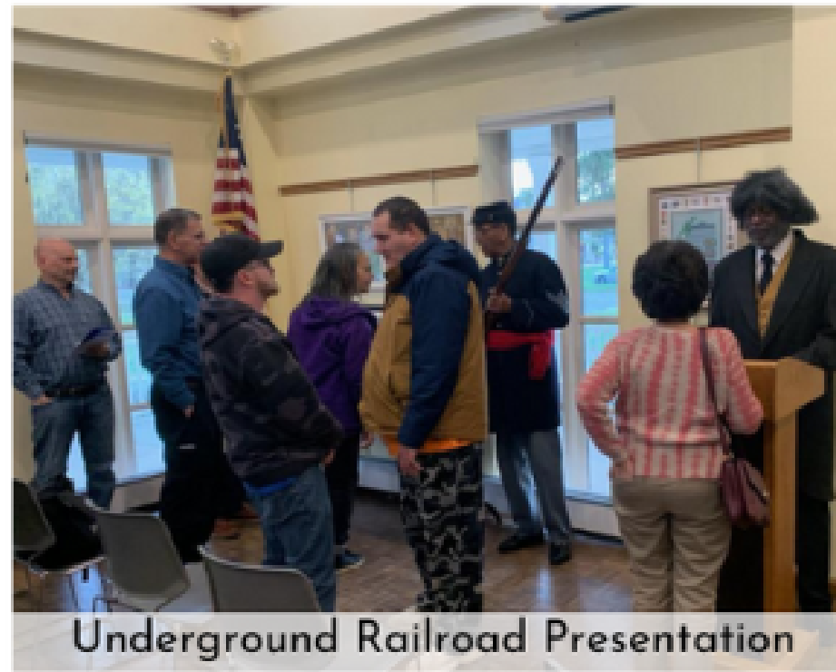
Underground Railroad Presentation