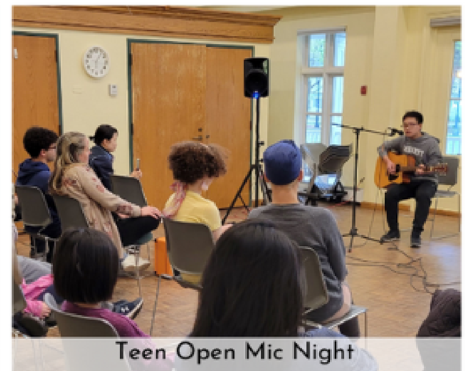
Teen Open Mic Night