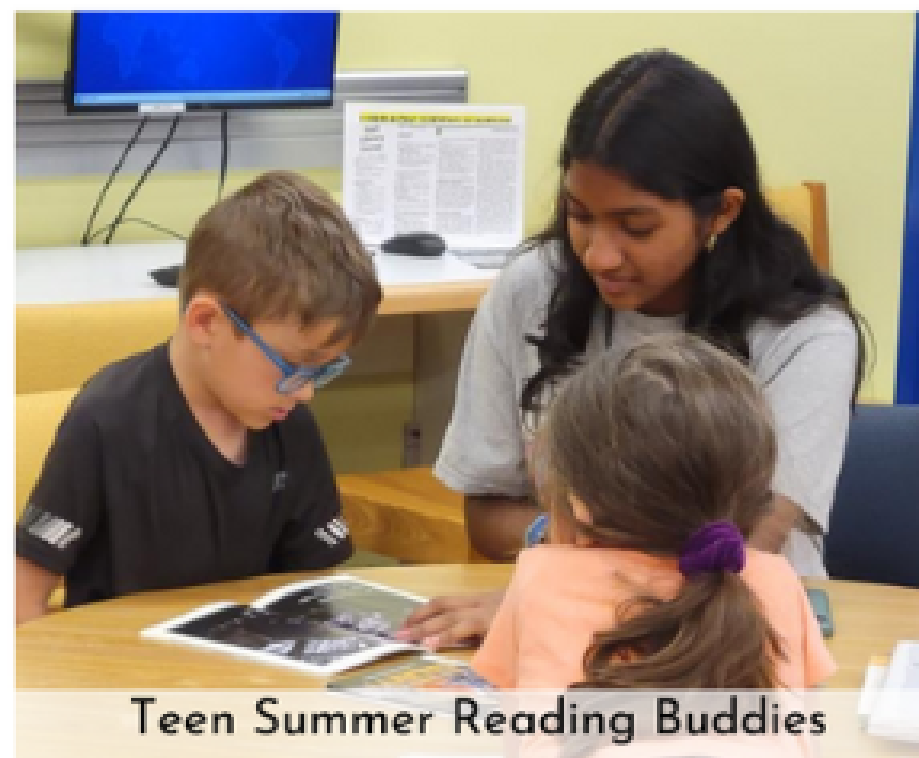
Teen Summer Reading Buddies