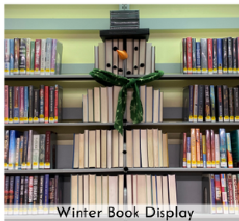
Winter Book Display

227,362 books, movies & audiobooks were borrowed 123,985 e-books, e-magazines & e-audiobooks were downloaded or streamed